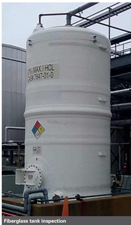
Fiberglass tank inspection

The FRP industry has historically made limited progress with developing full-fledged robust sustainable inspector training and qualification practices in response to the EPA and OSHA rules at law. Niche industry organisations with well-intended professionals supporting the pulp and paper, petroleum and chemical processing