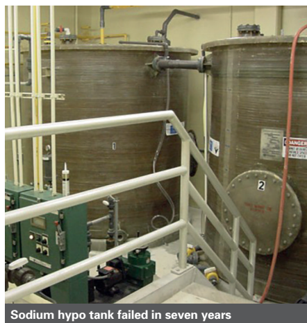
Sodium hypo tank failed in seven years