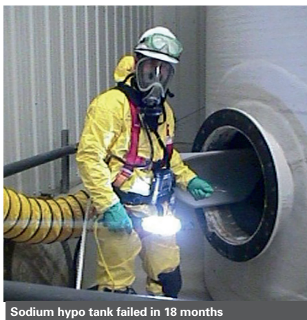
Sodium hypo tank failed in 18 months